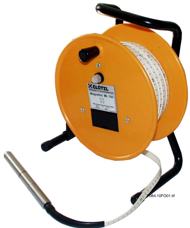
Figure.: Magnetic settlem. plumb with 100 m length with light-weight hand reel

All parts of the instrument are corrosion-resistant. The instrument is supplied ready for operation with leak-proof batteries.