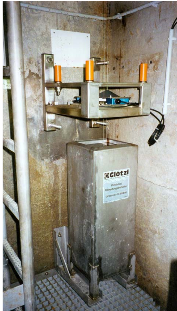
Pendulum plumb measuring point with electronic pump measuring system